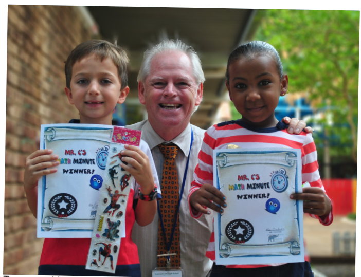
THIS WEEK'S MATH MINUTE WINNERS

Q: HOW MANY DAYS DOES THIS MONTH (SEP- TEMBER) AND THE NEXT MONTH (OCTOBER) HAVE ALL TOGETHER?